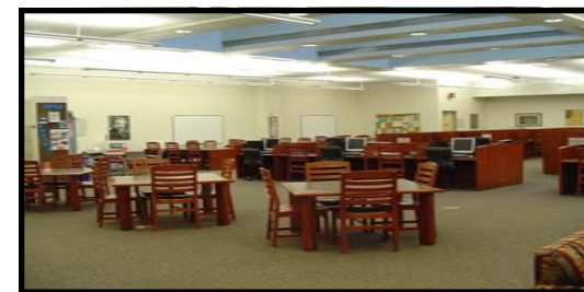
GPSA Study Area - Student Computer Lab with 38 Desktop PCs, and wireless network access

The GPSA and Graduate College host an annual Research Forum providing graduate and professional students an opportunity to share their research with peers and faculty across the UNLV campus. Entry forms are available on the GPSA website.