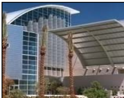
The GPSA is located on the third floor, room 3251, in the Lied Library

The Graduate & Professional Student Association serves all currently enrolled University of Nevada, Las Vegas graduate and professional students. We maintain a working office equipped with a copier, fax, flat-bed scanners, color laser printer, Scantron, typewriter, office supplies, and computers with printers and Internet access. The GPSA Council consists of a representative from each academic department or professional school offering either a graduate or a professional degree. Meetings are held at the beginning of each month during the fall, spring and summer semesters and open to all graduate and professional students. The Executive Board of the GPSA Council consists of four elected positions: President, Vice President, Secretary, and Treasurer. The GPSA Council members are appointed to various committees on campus to provide a voice for all UNLV graduate and professional students.