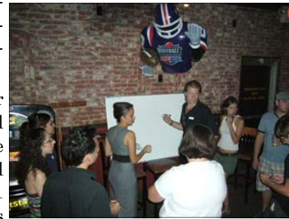
Graduate students play Pictionary at PT Pubs at the GPSA Welcome Back Fall 2008 Social

Questions: Contact Emy Laija, Committee chairperson, laijae@unlv.nevada.edu