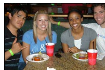
The Department of Physical Therapy graduate students gather at last month's GPSA social, held at the Play of the Day.

GPSA hosted socials provide an informal forum for networking and conversation among students from across the various colleges and disciplines. The socials are held the second Friday of each month. Don't miss the next event scheduled for the Freakin' Frog, Friday, November 9th, located @ 4700 S. Maryland Parkway (across the street from UNLV). Free appetizers are provided until funds are exhausted. Come wearing a hat or t-shirt from your alma mater!