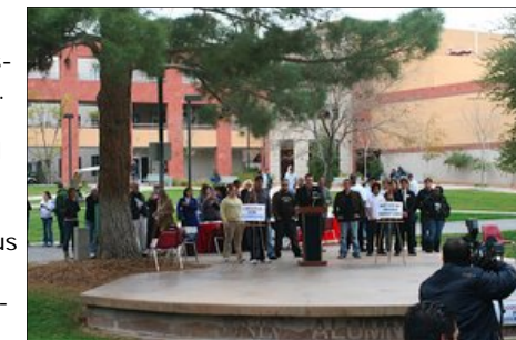
UNLV Budget Rally December 6, 2007