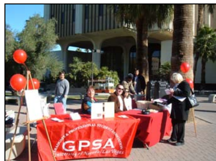
GPSA members manning the information table

On November 26, 2007, the Graduate & Professional Student Association held the first annual GPSA Awareness Day from 10 a.m. – 2 p.m. at the Pida Plaza in front of the Student Union. GPSA representatives talked with students over a cup of coffee and