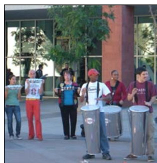
UNLV Mociada Rebelde drum group

group, "Mociada Rebelde", making this a rousing success!