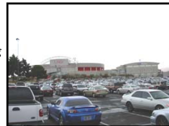
Parking lot at TMC

and Student Services. (In other words, if you want to go from CBC to the library, prepare yourself for a long ride—or you could just walk). The purpose of “The Ride” is to get you from your remote parking spot to campus. Once on campus (CBC or Lied), it's back to walking. Say it with me now: Walking is great. Exercise is good for me.