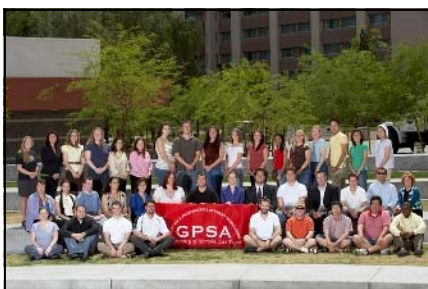
GPSA Council 2007-08