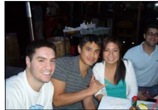
Graduate students @ a recent social

Mark your calendars to meet, greet and eat with your fellow graduate and professional students, Friday, August 29th at PT Pub's, across the street from UNLV @ 1089 E.