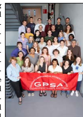
GPSA Council 2006-07

school, serve on the GPSA Council. The Executive Board, also members of the Council, are elected positions consisting of a President, Vice President, Secretary, and Treasurer. The Council meets each month @ 2 p.m. in the Student Union, in an open forum to discuss current issues, activities, and address concerns that impact graduate and professional students.