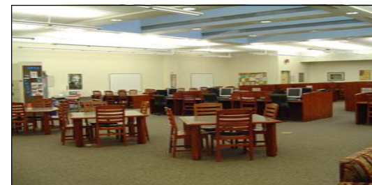
GPSA Study Area - Student Computer Lab with 40 desktop PCs, and wireless network access

Each spring the GPSA and Graduate College host an annual Research Forum providing graduate and professional students an opportunity to share their research with peers and faculty across the UNLV campus. Entry forms are available on the GPSA website.