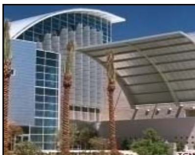
The GPSA is located on the third floor, room 3251, in the Lied Library

The Graduate & Professional Student Association serves all currently enrolled University of Nevada, Las Vegas graduate and professional students. The GPSA maintains a working office equipped with a copier, fax, flatbed scanners, color laser printer, Scantron, typewriter, office supplies, and computers with printers and a small kitchen area. The GPSA Council consists of a representative from each academic department or professional school offering either a graduate or a professional degree. Meetings are held at the beginning of each month during the fall, spring, and summer semesters and open to all graduate and professional students. The Executive Board of the GPSA Council consists of four elected positions: President, Vice President, Secretary, and Treasurer. The GPSA Council members are appointed to various committees on campus to provide a voice for all UNLV graduate and professional students.